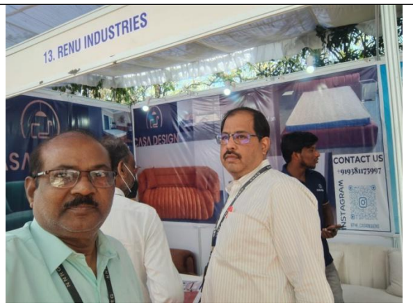
Some of the prominent stalls include the following: